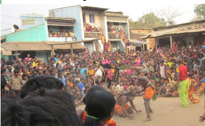
Hundreds watching Hindu rituals in Orissa town