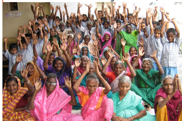
HOPE Children and Manna Program Widows, 2007

twice a day, giving them a new dress each year, making sure they have sweaters, blankets and scarves for the cold weather, and being able to repair some of their thatched roofs. We're trusting in His wisdom and provision in regard to caring for the more desperate widows who are homeless or reach a point when they need someone to care for them, but have no one to do that work. Again, please pray for us, as these are among the most forgotten, neglected and rejected people in the world, but the Father has not forgotten! "For the needy will not always be forgotten, nor the hope of the afflicted perish forever." Psalms 9:18